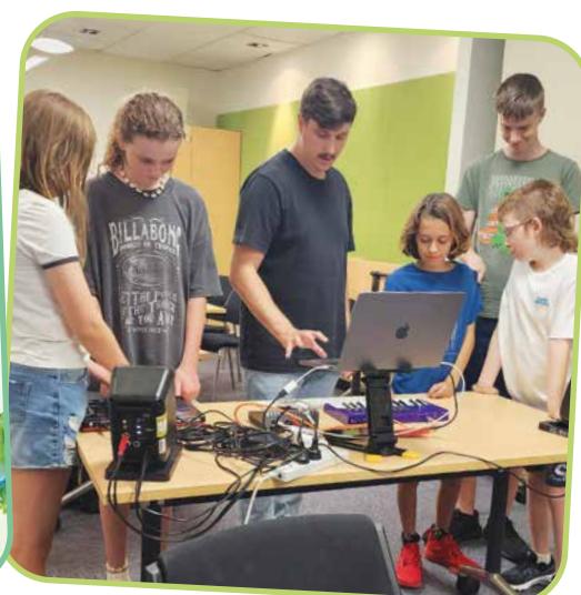
Summer Sounds Workshop at Clarkson Library.