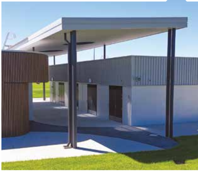
Heath Park Pavillion, Eglinton.

The new pavilion features changerooms, first aid rooms, activity rooms, an umpire's room, universal access toilets and showers, kitchens, kiosks and storage. In addition to sporting events, the pavilion will serve as a venue for community gatherings, workshops and celebrations. This development marks a significant investment in the local area, promising to enhance both the social and physical well-being of the community.