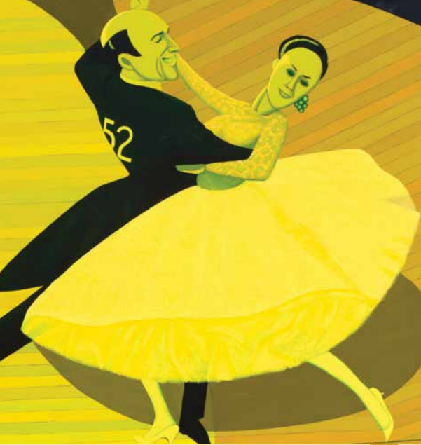
Detail: John Brack British Modern 1969. The State Art Collection, The Art Gallery of WA. Purchased 1984.