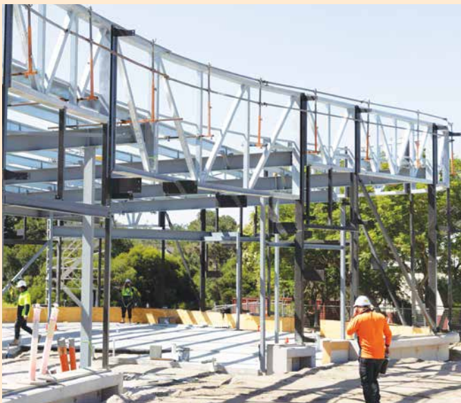
Construction is underway at Dordaak Kepup.