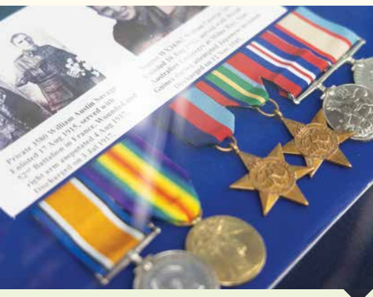
Medals on display at the Wanneroo RSL.

"Forty-eight sailors, we had two bullets each and no water, nothing."