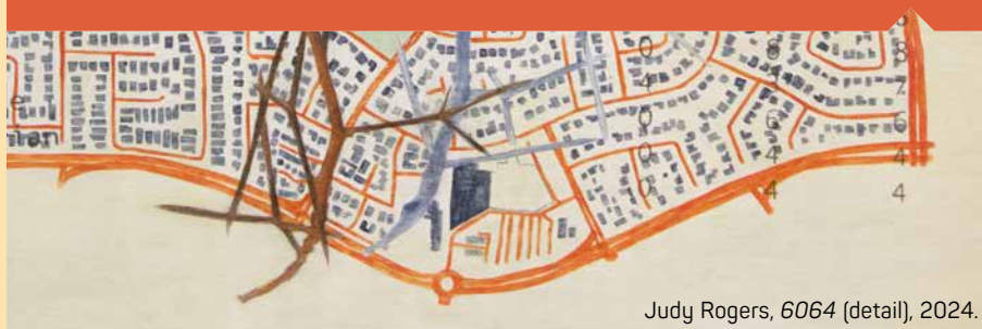
Judy Rogers, 6064 (detail), 2024.

The Antipodean Manifesto features a catalogue of works that express a longing to preserve figurative art and its image, while redefining boundaries in contemporary art.