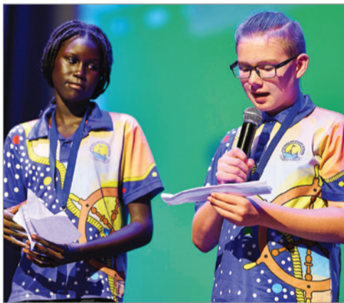
Students from Alkimos Primary School.

The City of Wanneroo School Leadership Program returns for 2025, with the goal of empowering young people to become change makers in their community.