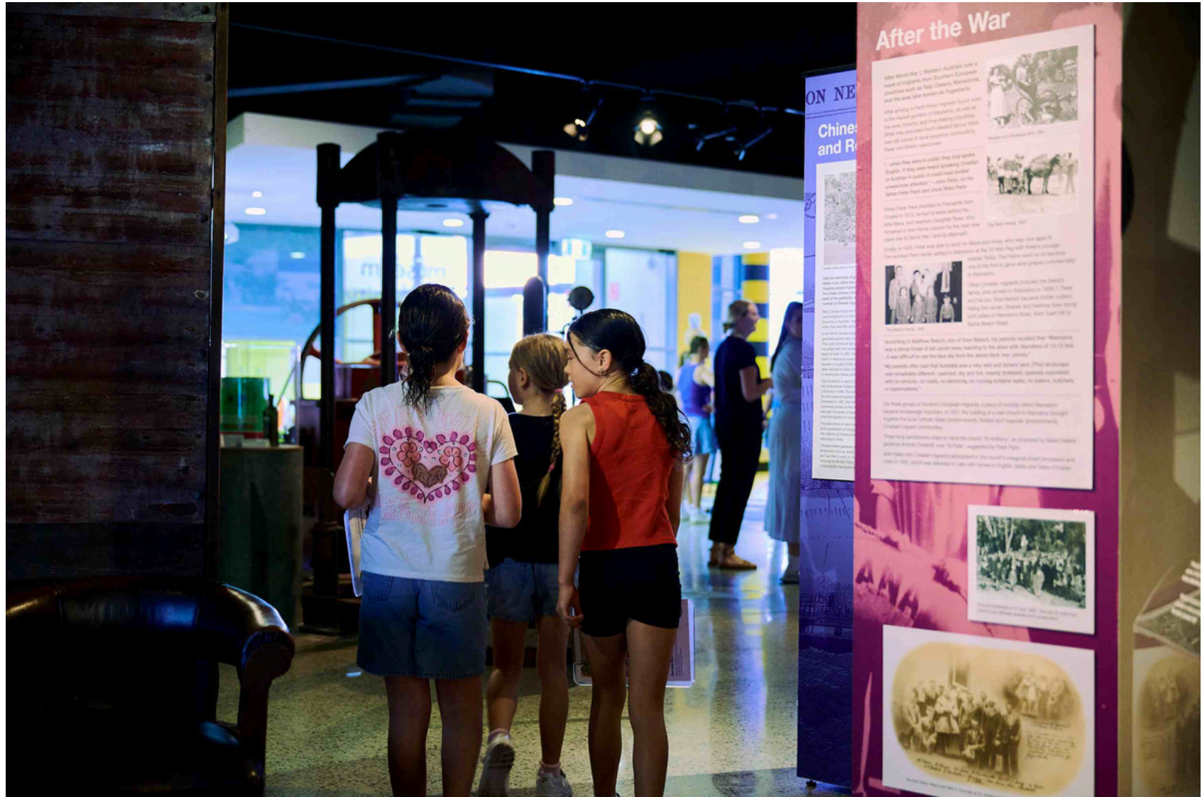
To stay safe, I walk in the museum.