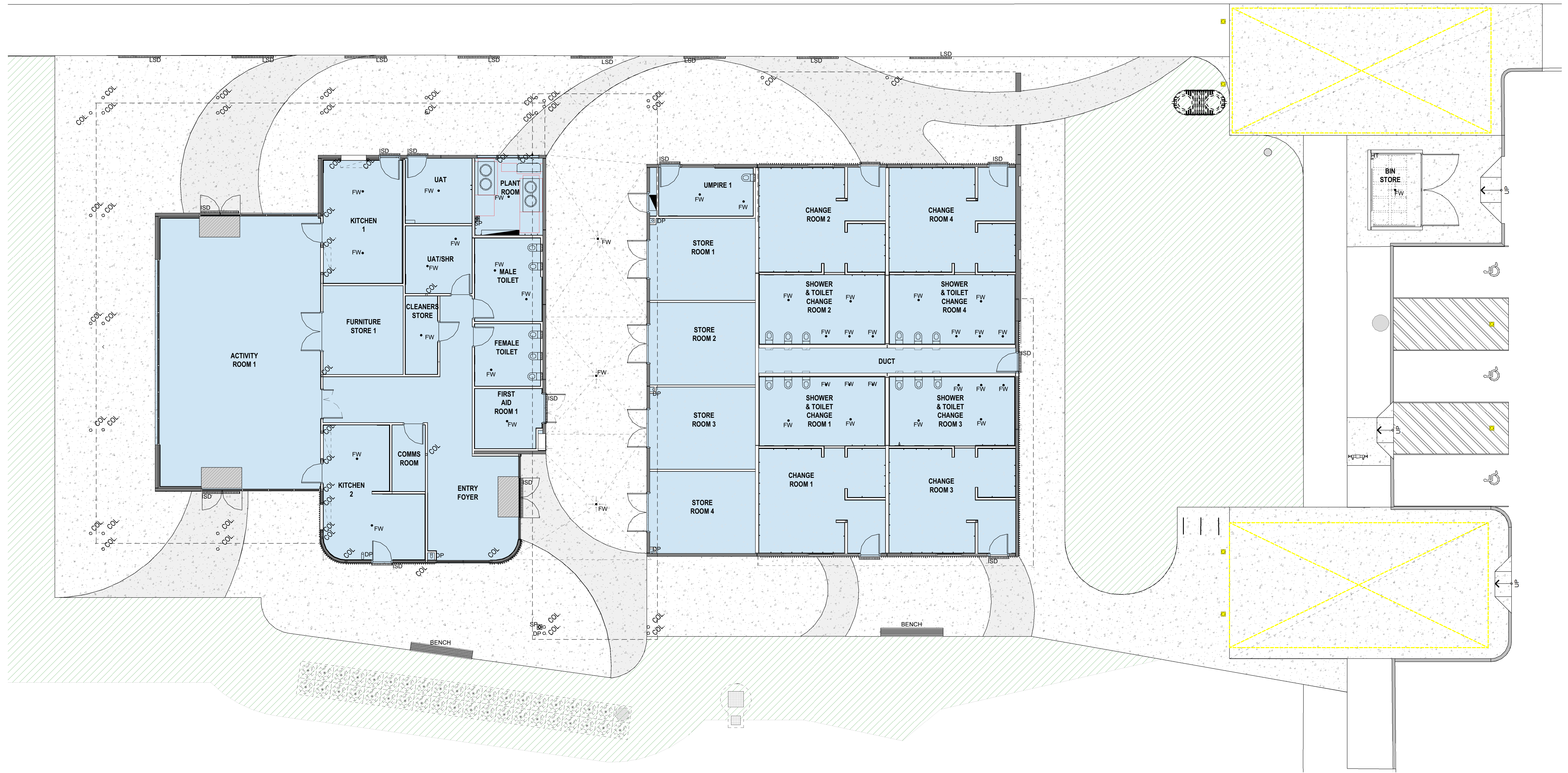
1 PROPOSED OVERALL FLOOR PLAN 1:100